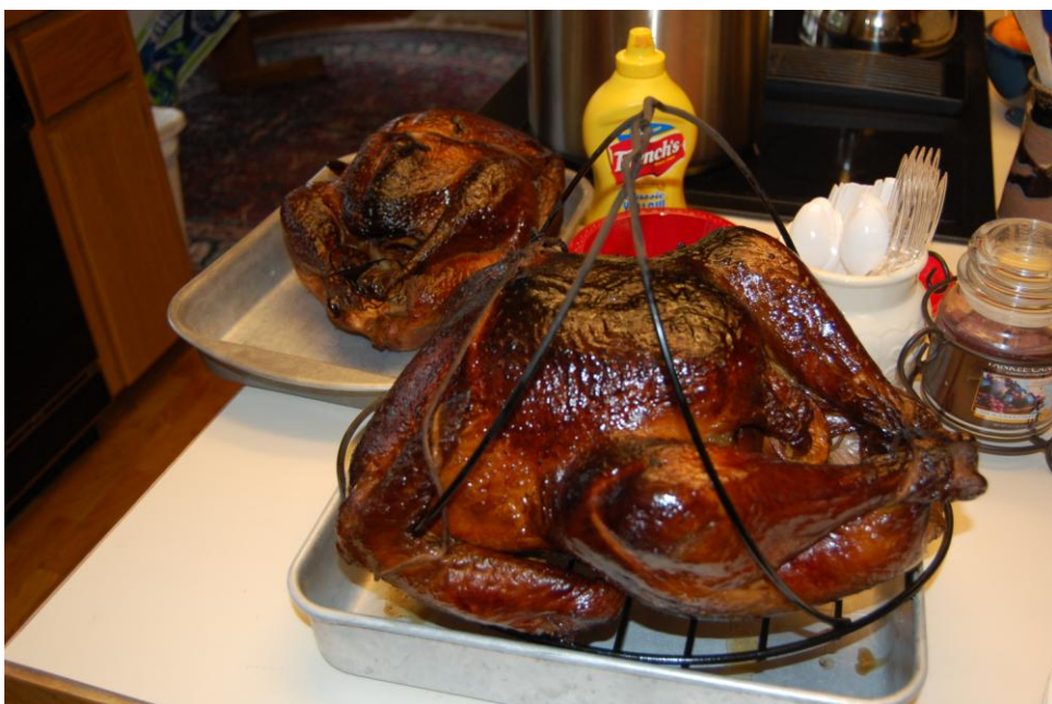
Mesquite smoked turkeys

Corvette Top Chef Challenge for those who think they can cook and those who really can . The rules will be simple; there are no rules, no limits. Hopefully, we will see some planning, thought and effort go into the dishes. No one will be “chopped” and everyone rewarded for their participation. Naturally, those not competing will “judge” the presentations. So, even being present will be a wonderful experience. We are planning for March 19 th . Set up your favorite recipe and menu. You can present an appetizer, main dish or dessert.