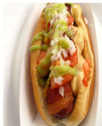
Sonoran Hot Dog