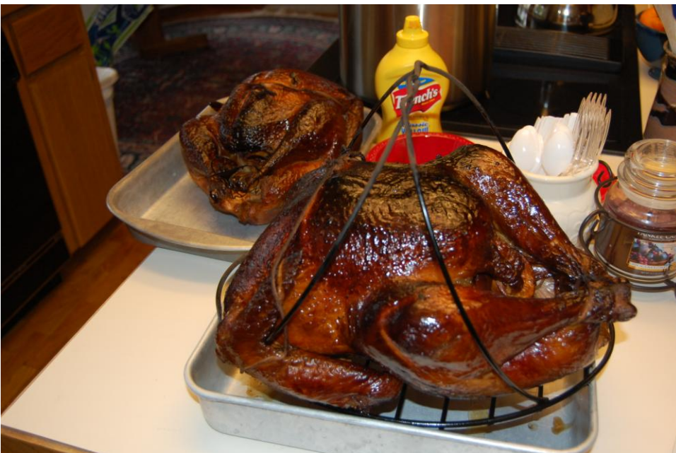
Mesquite smoked turkeys

We are getting together a Corvette Top Chef Challenge for those who think they can cook and those who really can . The rules will be simple; there are no rules, no limits. Hopefully, we will see some planning, thought and effort go into the dishes. No one will be "chopped" and everyone rewarded for their participation. Naturally, those not competing will "judge" the presentations. So, even being present will be a wonderful experience. We are planning for March 19 th . Set up your recipe and menu.